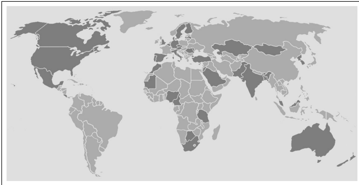
Figure 3. Worldwide Locations of Authors

think, been over-advocated, considering that the academic domain as a whole still does not have sophisticated methodological foundations and has been called ‘methodologically limited’ (Bulfin et al., 2014: 403; Schön and Ebner, 2013). Moreover, believe 35% of the authors, E&T findings are presented without rigorous evaluation, and/or their positive effect on learning is insufficiently verified or proved. And this perceived excessive use of technology in education does not necessarily help with learning but rather may result in negative cognitive and/or sociological consequences. The writings of Cifuentes et al. (2011), Spitzer (2012), Tondeur et al. (2013) and Ertmer et al. (2014) constitute a valuable reading list in this regard.