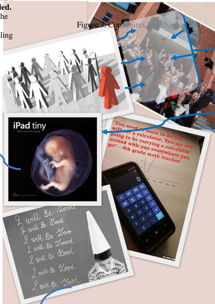
Figure 3. Complaints about change

“...technology is the main thing that’s changing. I know regulations and all that have all changed, but the main thing that changes in our generation and will change in the next generation is technology – technological advances”