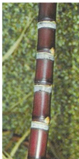
Figure 2. Saccharum cane (red).

To meet the sugar demand in colonial India and in Britain, the British established the Sugarcane Breeding Station at Coimbatore in 1912 with Barber, as its first superintendent, who recruited TSV as his deputy. TSV must have noted that in the warm climate some close relatives of sugarcane would flower, enabling the production of hybrid canes by crossing, a physical process by which the pollen (male reproductive cell) is transferred to the receptive surface of the female reproductive organ. TSV collected all plants with cane phenotype that suited the prevailing hot (summer, April–June) and cold (winter, November–January) conditions in the Indo-Gangetic Plain.