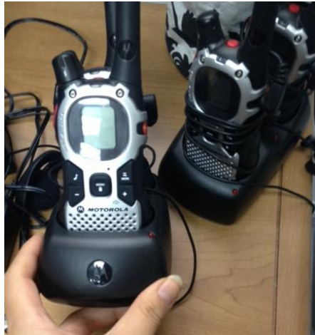
Figure 2: Wireless handsets

In the second phase of the cycle, each PST was fitted a wireless earpiece set, shown in Figure 2, and taught their prepared mini-lesson to their peers, practicing their specific skill(s). The PST received feedback from the coach in real time via the earpiece, who was seated at the back of the classroom, and was expected to implement the feedback immediately, adjusting their behaviour to meet their SMART goals. The coach, a teacher educator in an English teacher education course, experienced observer, and skilled in RTC coaching, ensured that disruption was kept to a minimum by speaking very quietly into a headset, and also made notes on the PSTs' performance during the process.