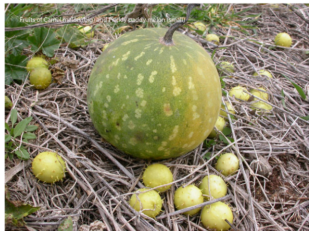
Figure 1: Fruits of invasive Cucurbitaceae in Australia. The large fruit is Citrullus lanatus (camel melon), which has an average diameter of 7–10 cm. The smaller fruit is Cucumis myriocarpus (prickly paddy melon), which has an average diameter of 2–3 cm. The fruit of Citrullus colocynthis (colocynth melon) is similar in size and appearance to that of C. lanatus , but C. colocynthis rind tends to have a mottled or mosaic pattern as opposed to the spotted or striped pattern seen on C. lanatus (Shaik et al. , 2012).

There has been confusion regarding identification of wild melons in Australia before flowering, at both the