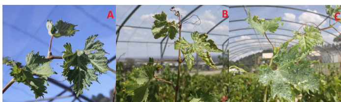
Figure 2. Grapevine ( Vitis vinifera L. cv. Tempranillo) leaves exhibiting signs of 2,4-D (A), Dicamba (B) and MCPA (C) injury. Signs of 2,4-D injury include upward leaf cupping, serrated margins and discoloration around veins. Injuries associated with Dicamba exhibit upward curling of leaf margins, and yellow and brown interveinal discoloration. Injury related to MCPA includes interveinal white spots.

7 Rossouw, G.C., Holzapfel, B.P., Rogiers, S.Y., Gouot, J.C., and Schmidtke, L.M., 2019. Repercussions of four herbicides on reproductive and vegetative development in potted grapevines. Australian Journal of Grape and Wine Research , 25, 316–32