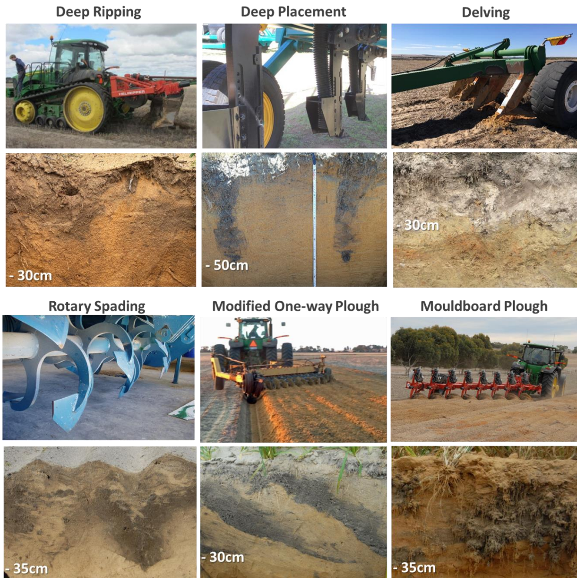
Figure 1. Images demonstrating a range of strategic deep tillage implements and the impact they have on the soil profile. Note incorporation dark coloured topsoil caused by each implement (Photos: Stephen Davies, Department of Primary Industries and Regional Development WA and Erin Cahill, agVivo image modified one-way plough).

Soil inversion is perhaps the most extreme strategic deep tillage option, resulting in the topsoil being nearly completely buried underneath a layer of subsoil 0.15-0.35 m deep (Figure 1). This provides an opportunity to: