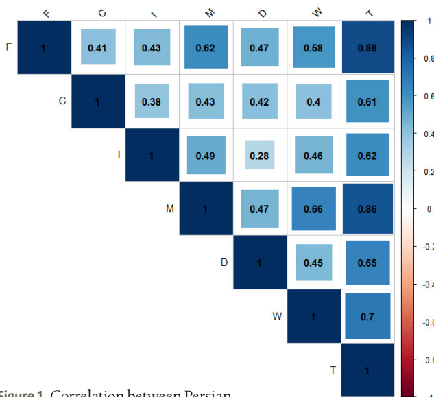
Figure 1. Correlation between Persian version of SHSQ-25 (P-SHSQ-25) and its domains and World Health Survey (WHS) individual questionnaire. F – fatigue, M – mental status, C – cardiovascular system, D – digestive system, I – immune system, T – total score of P-SHSQ-25, W – World Health Survey (WHS) individual questionnaire

Table 2 shows the results of the EFA. The 25 items of P-SHSQ-25 were reduced to 5 factors with an eigenvalue of >1.00 which explained 63.62% of the variance of the data set. The pattern of loading of the items on factors was similar to the original SHSQ-25 version but only the item SHSQ5 about dizziness was not loaded on the five domains of P-SHSQ-25. Figure 2 presents the confirmatory factor model of P-SHSQ-25 and its five domains. All P-SHSQ-25 items had factor loading higher than 0.40 on the corresponding domain. The CR values for the five domains of P-SHSQ-25 were higher than 0.70 indicating good construct reliability. The AVE values for fatigue, cardiovascular system, digestive tract, immune system, and mental status were 0.48, 0.50, 0.62, 0.58, and 0.56, respectively indicating evidence for moderate-good construct validity. The model fit summary was as follows: RMR=0.05, SRMR=0.06, GFI=0.83, NFI=0.83, TLI=0.87, CFI=0.88 and RMSEA=0.07. The results of MI tests and model comparisons showed not statistically significant for \Delta \chi^2 ( P>0.05 ) and \Delta CFI were also lower than the cut-off value of 0.01. This indicates factor loadings, intercepts and residuals can be assumed to be equal across the groups ( Table 3 ). The P-SHSQ-25 is provided in Appendix A in the Online Supplementary Document .