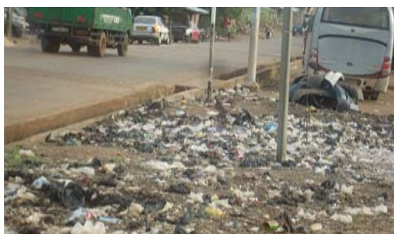
Fig. 3 Indiscriminate dumping in Tamale Metropolis

Despite the apparent weak institutional capacity to manage environmental sanitation in Tamale, the interviews with the city residents revealed that the poor attitudes of some city residents appear to be the major cause of poor environmental sanitation. Majority of city residents interviewed admitted that they have engaged in acts of indiscriminate disposal of wastes. As illustrated in Fig. 3, indiscriminate disposal of solid waste mainly plastic and polythene materials has become a communal practice in the metropolis causing urban blight. Although some city residents attributed the indiscriminate disposal of waste to lack of refuse collection and management system, the study findings suggest that majority of them littered the streets on purpose. One city resident commented that: "... the Zoomlion workers (private waste management institution) have been paid to clean the city, if we don't litter the streets, they won't have any work to do ...". This quote emphasizes the apathy some of the residents in the metropolis have developed towards environmental sanitation, a situation which has resulted in heaps of wastes on the road sides.