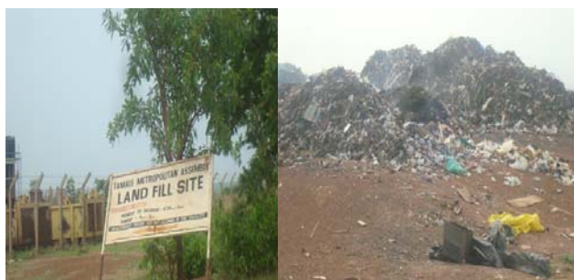
Fig. 2 The state of the Tamale landfill site

constraints. According to the WMD, not less than GH¢100,000 (US$ 66,600) is needed weekly to maintain the land fill site, a financial commitment which the city authorities' claim cannot be met due to inadequate resources. Ideally, the land fill site is supposed to be treated weekly to avoid or minimize any hazards such as outbreak of diseases but the study findings indicate that since 2010 the land fill has not received any treatment. As a result, residents living close to the facilities lamented the awful conditions of stinking heaps of waste from the land fill site.