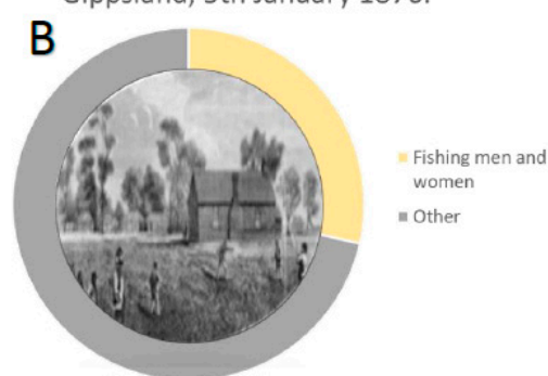
Figure 2. Reconstructed time budget for cultural fishing practices at two Stations 1875–1876. (A) By 1875 in Victoria male Aboriginals at Framlingham Station were permitted to fish only during Summer evenings. The pie diagram represents 24 h and in yellow the hours males were permitted to fish each day during summer; (B) In 1876 at Church Mission Station both men and women were only permitted to fish two days per week. The pie diagram represents seven days and in yellow the two days permitted for fishing. Original Figure developed from information at Victoria (1876). (Any images used in development of this figure were freely available via open access Creative Commons).

Church, Mission Station, Lake Tyera, Gippsland, 5th January 1876.