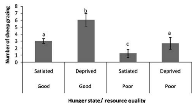
Figure 1 Mean \pm s.e. of sheep grazing per treatment. Plot shows means for days 1 and 2, as day had no significant effect.

Feeding motivation and resource quality had a significant interactive effect on grazing time (ANOVA: F_{1,7} = 17.8 , P = 0.004 ; Figure 1). No other second-order interactions (hunger \times day, ANOVA: F_{1,7} = 0.001 , P = 0.97 ; resource \times day, ANOVA: F_{1,7} = 0.008 , P = 0.93 ) or third-order interactions