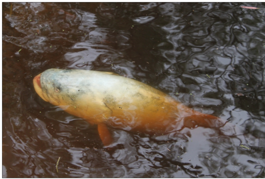
Figure 1. A severe hypoxic blackwater event resulted in extensive fish kills in the Murray-Darling Basin, Australia in 2010/11. Photograph shows a Murray cod Maccullochella peelii (Mitchell) appearing to perform aquatic surface respiration (ASR) during the hypoxic blackwater event in the Edward River near Moulamein, New South Wales. doi:10.1371/journal.pone.0094524.g001

acute hypoxia and high levels of DOC. However, after 10 years of drought, since the year 2000, the MDB experienced large-scale floods followed by hypoxic blackwater events which caused widespread fish kills [2,8]. Estimates of the total number of fish mortalities and species composition following this event have not been published but anecdotal and scientific reports on fish kills in the MDB have tended to focus on large-bodied recreationally important species [7,8,9]. It remains unclear whether large-bodied species are disproportionately reported in fish kills because of low tolerances to hypoxic blackwater or because small-bodied species are under-reported. Previous research on Australian freshwater fishes suggests a relatively high degree of hypoxia, DOC and toxic leachate tolerance amongst small-bodied species [10,11,12] but very little research has been undertaken on the hypoxic blackwater tolerances of large-bodied lowland fishes [4,13,14] most commonly reported in fish kills [7,9].