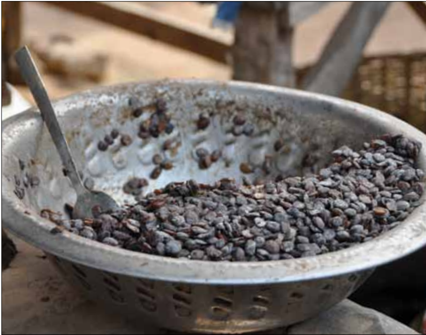
“Soumbala” produced from seeds of Parkia biglobosa , sold in a local market in Parakou, Benin. The availability of and access to forest foods may decline as a consequence of deforestation, forest degradation and overexploitation