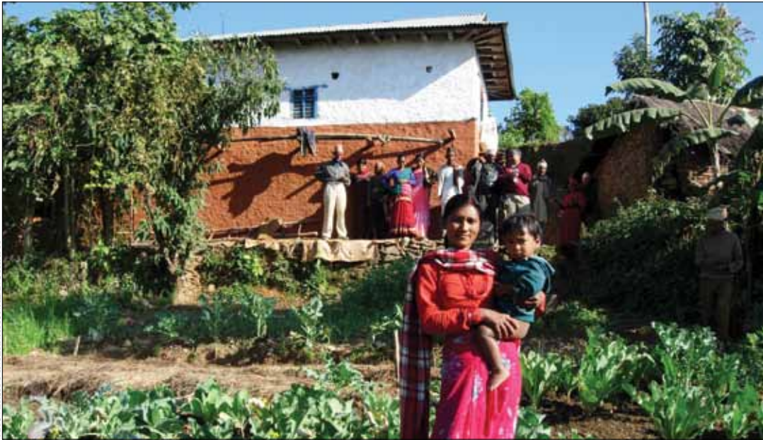
In Gulmi in western Nepal, a socially marginalized family poses in their homegarden, which is an essential source of nutritious foods, including several derived from trees. Homegardens are key elements in rural landscapes; they are important reservoirs of agricultural biodiversity and of the knowledge to make use of it, and they can also help empower women. Better approaches are needed to manage heterogeneous landscapes for nutrition-sensitive food-production systems

Women have a central role in ensuring food security and adequate nutrition (de Schutter, 2011), and interventions directed towards women are likely to have a particularly beneficial impact (Hoddinott, 1999). Supporting the role of women as producers and consumers of food would help remove barriers to improved nutrition, including the increased consumption of forest foods. A process led by FAO that reviewed guidance documents developed by several international organizations found that empowering women is a key principle in better linking agriculture and nutrition (Herforth, 2013).