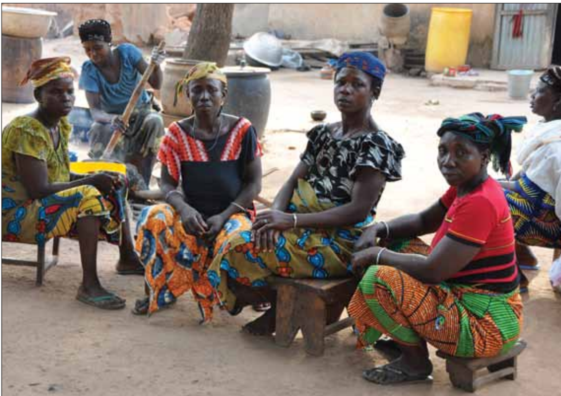
Women in Parakou, Benin, gather for a focus group discussion about the food tree species commonly used in the diet during food shortage periods

Many traditional communities actively manage the wild resources they use. Where there is conflict over the use of multi-purpose species that supply both timber and food products, forest management plans should be negotiated with timber companies and adapted to consider the interests of both local communities and timber companies (Ndoye and Tieguhong, 2004). Such an approach should be based on sound cost-benefit analyses that take into account the nutritional and cultural importance of forest foods in the diets of the most vulnerable: women and children.