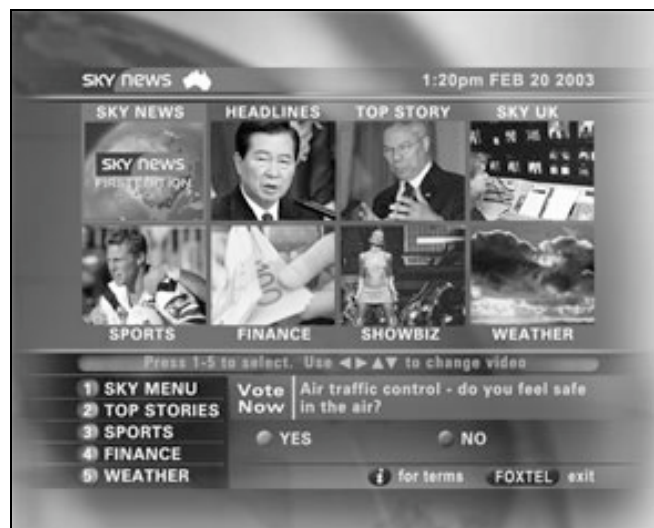
Figure 1: The Sky News Active interface, showing 8 mini-screens of available content.

A mini-channel can then be selected using the remote control, and the main Sky News Active interface appears. The screen is divided into 3 key content areas. About a quarter of the screen is taken up with the video content of the selected channel and,