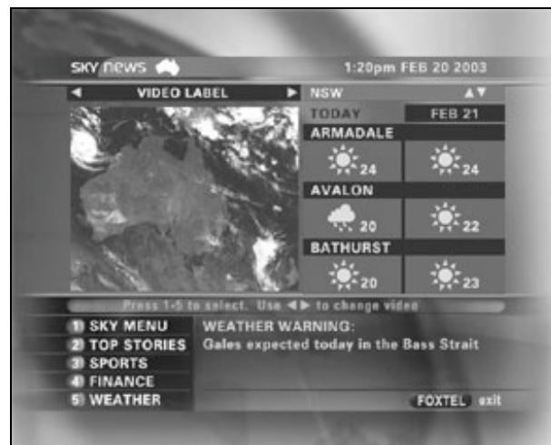
Figure 2: The Sky News Active interface (Weather), showing division of screen content

although the digital technology allows the user to resize the screen, it is being offered initially in this quarter-screen mode because of bandwidth issues. To the right of the video element is a box offering text-only news stories, a selection of current headlines, or even specialist data relevant to a particular mini-channel, such as the weather information shown in Figure 2. At the bottom of the screen is a “news ticker” with constantly changing headlines or information snippets, and some navigation buttons as fast links to the main channel options.